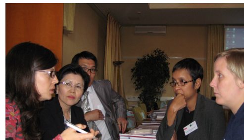
The International HPH Network builds on discussions and collaboration from international colleagues with different approaches to and ideas of Health Promotion.

pre-dominantly based on professional interest and work. Whether it be local, national or international, HPH lets you take part in lots of activities which practically cover the entire spectrum of important issues: getting inspired and learning more about Health Promotion, visiting and sharing knowledge with others that have something to show, convincing managers, obtaining funds, designing and implementing Health Promoting projects, publishing and disseminating results and knowledge, and much more.